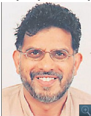
Miloon Kothari, Convener WGHR

The government of India is once again rehashing an old debate, stubbornly refusing to recognise it has been long resolved. It refuses to report to UN human rights monitoring committees on caste-based discrimination, and is now repeating its long-held stand that caste is not included in the mandate of the International Convention on the Elimination of All Forms of Racial Discrimination (CERD).